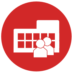
MARKET RELEVANT SKILLS