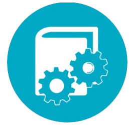
WORKPLACE & CLASSROOM LEARNING